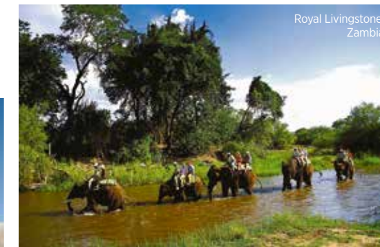
Royal Livingstone, Zambia