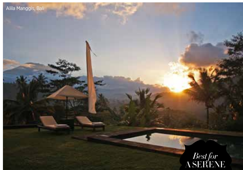
Alila Manggis, Bali