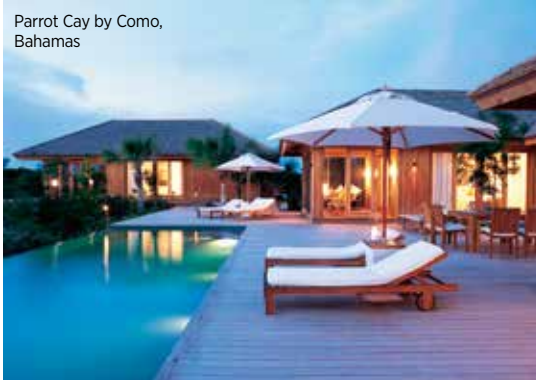
Parrot Cay by Como, Bahamas

From Dhs5,000 a night; Velaaprivateisland.com