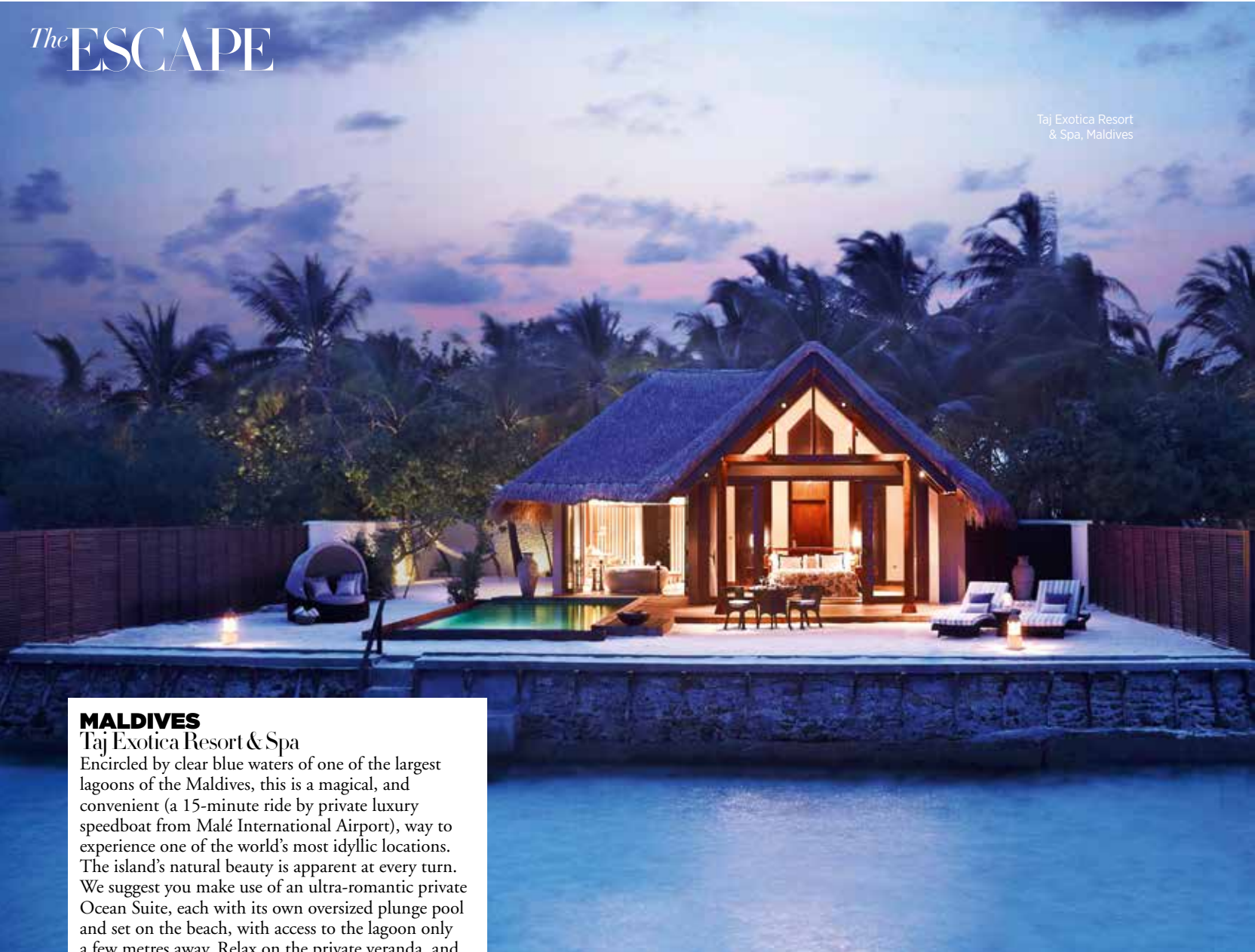
Taj Exotica Resort & Spa, Maldives