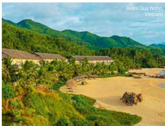
Avani Quy Nhon, Vietnam