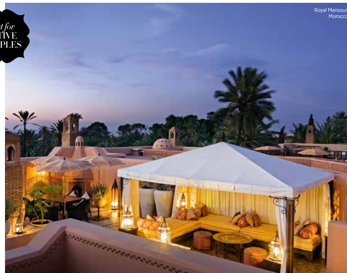
Royal Mansour, Morocco