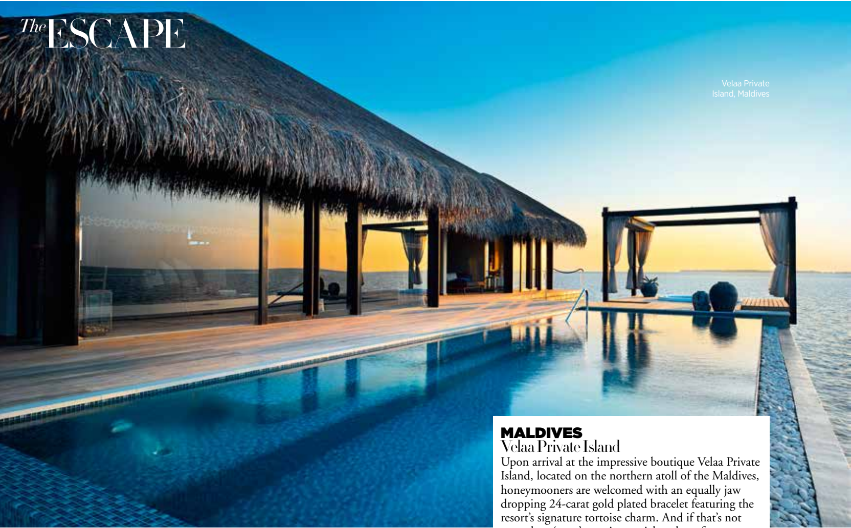
Velaa Private Island, Maldives