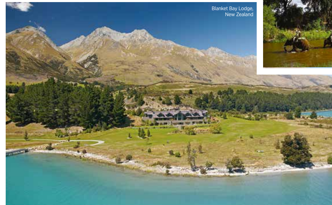
Blanket Bay Lodge, New Zealand