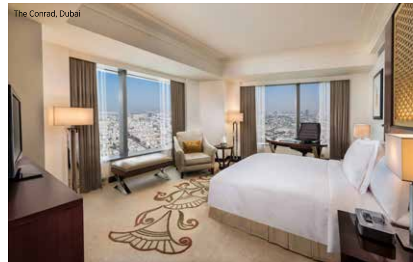
The Conrad, Dubai