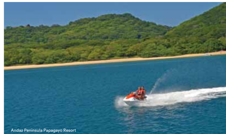
Andaz Peninsula Papagayo Resort

Grand Hyatt Playa del Carmen, Mexico Just opened on Mexico's famed Riviera Maya, this beautiful beach resort has striking design, lavish swim-up suites, three spectacular infinity pools and a 6,000 square-foot spa. As stylish as it may be, it's also family-friendly with the state-of-the-art #Hashtag teen arcade, complete with table tennis, foosball, video games and 10-seat cinema. Younger guests, meanwhile, can enjoy wildlife shows, games, crafts and activities at the Camp Hyatt kids' club. hyattplaya.com