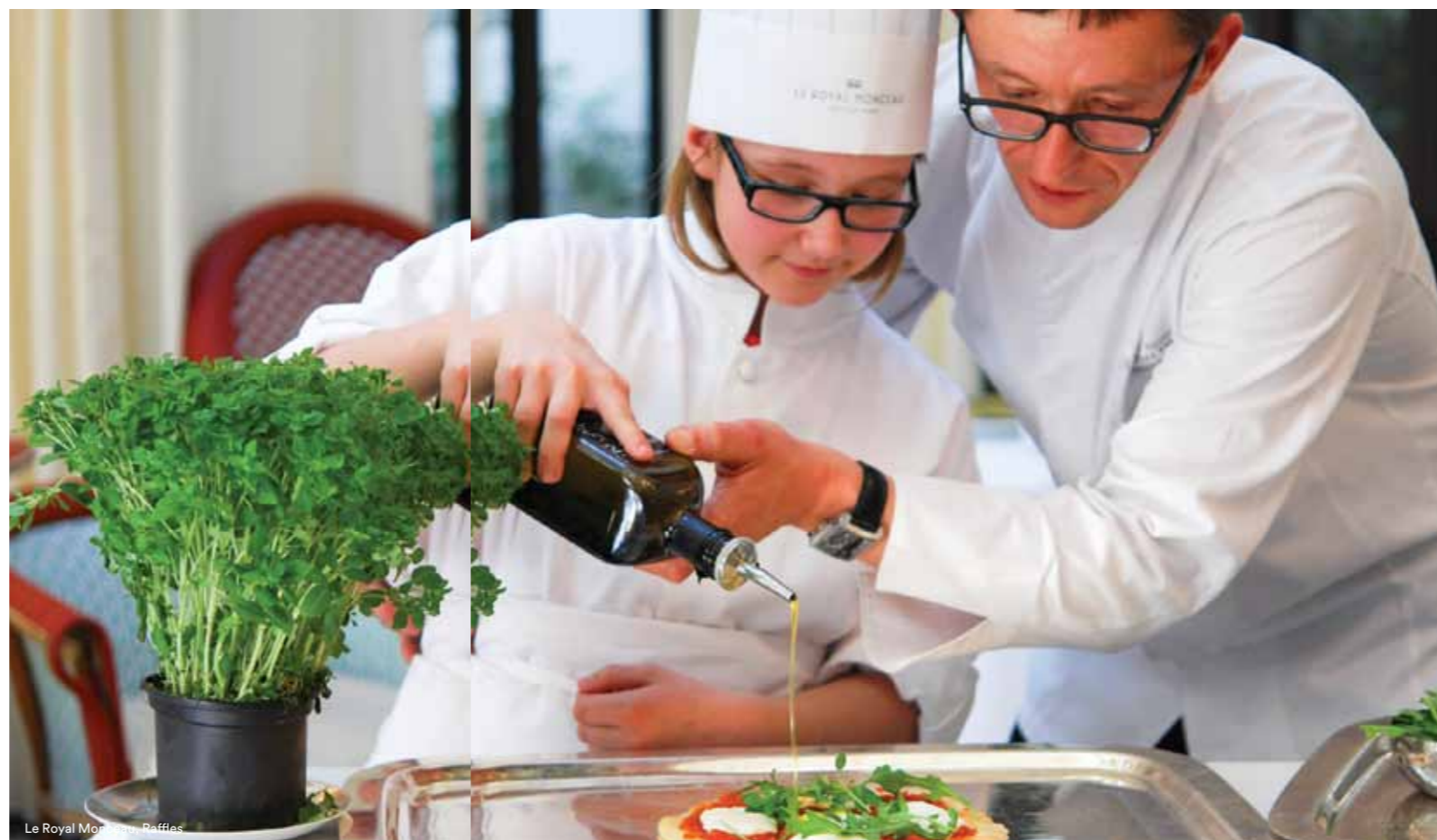
Le Royal Monceau, Raffles

Giraffe Manor, Kenya Set in a forest on the outskirts of Nairobi, this elegant manor house has ten rooms, landscaped gardens and sunny terraces. Its main draw, however, is the resident herd of Rothschild giraffe that often visit morning and evening, poking their long necks into the windows in the hope of a treat. Families can visit the AFEW Giraffe Centre next door and then take a jeep to the Sheldrick Wildlife Trust, where they can meet, feed and even adopt baby elephants. thesafaricollection.com