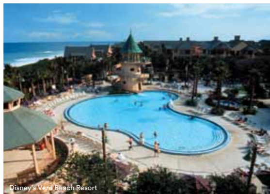
Disney's Vero Beach Resort

Disney's Vero Beach Resort, USA After you've done Walt Disney World, head two hours southeast to this hideaway on Florida's scenic Atlantic Treasure Coast. It's the perfect spot for low-key family activities like miniature golf, beachcombing, bike riding, campfire sing-a-longs and kayaking adventures. There's a Mickey Mouse-shaped pool, Disney Discovery Club and sea turtle beach walks, while teens will love the GPS-aided scavenger hunt and surf school. Parents, meanwhile, can indulge in spa treatments or a round of golf. disneybeachresorts.com