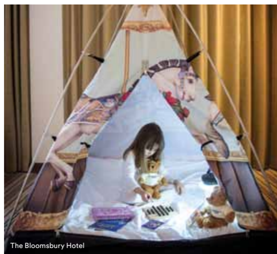
The Bloomsbury Hotel

The Bloomsbury Hotel, London This chic hotel lies at the heart of literary London, just down the road from the British Museum. Little ones can 'camp out' in their very own tepee bed, which can be set up in mum and dad's suite or in an interconnecting room. The tepee comes with a mattress and bedding, indoor camping lamp, hotel teddy bear, and a gourmet 'midnight feast' of cookies and a flask of warm milk. Under-5s eat for free in the hotel restaurant, too. doylecollection.com