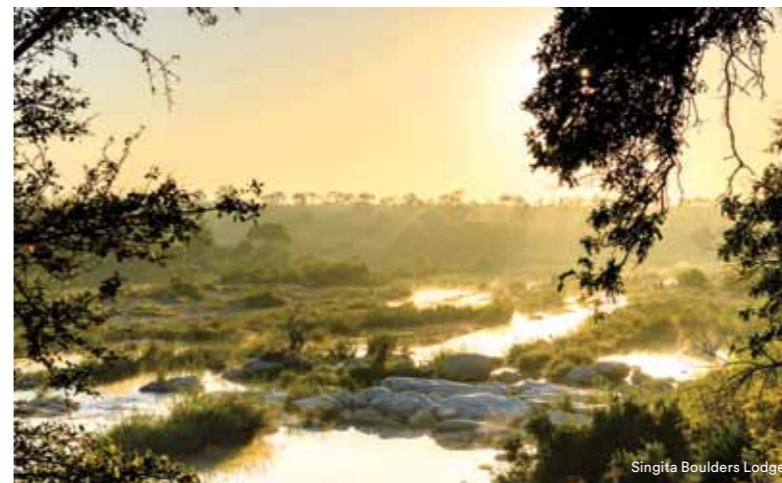
Singita Boulders Lodge

Le Royal Monceau, Raffles Paris, France This palatial hotel in the 8th arrondissement is renowned for its Philippe Starck-designed rooms and Michelin-starred restaurants. Le Petit Royal kids' club is just as inspirational, with a line-up of fun workshops held during Saturday Brunch so mum and dad can relax. Led by professional artists, each one is inspired by major exhibitions happening in the city. There are also pizza-making classes and DJ lessons for teens, along with treasure hunts through the Louvre and 'pirate' boat trips down the Seine. raffles.com